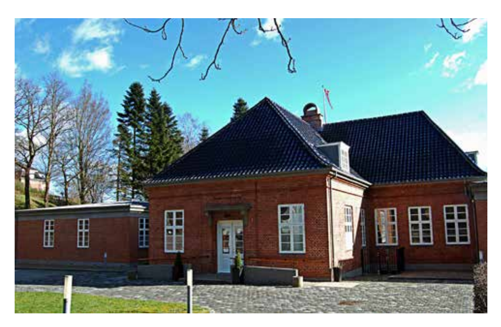
The Danish Museum of Nursing History, the former pavilion for the small children.

In 1999, the year of the 100-year anniversary of the Danish Nurses' Organization, the two completely renovated pavilions opened as the Danish Museum of Nursing History, which today is one of the few nursing museums in the world. Here guests can immerse themselves in the history of the nursing profession and rekindle own memories of hospitalization and other meetings with the healthcare system. For nurses, the museum is a unique experience, and it is being used in the education of both nursing students and other healthcare students.