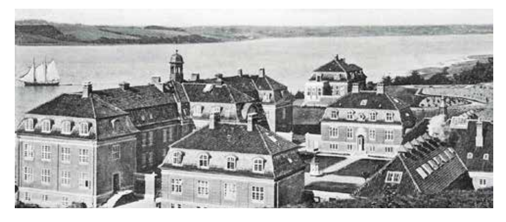
The Christmas Seal Sanatorium 1911. stating "The new Christmas Seal Sanatorium near Kolding Fjord, the cost of which has attracted so much attention that the timeliness now needs to be examined by a Commission".

The Christmas Seal became a huge success, and the Christmas Seal Committee started to plan and build a children's sanatorium. After many hardships with a wet underground and massive budget overruns, the Christmas Seal Sanatorium was inaugurated in Kolding in 1911. A majestic building equipped to set the gold standard for TB-treatment in Denmark