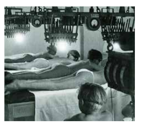
Treatment with carbon-arc light.

Some of the children were treated with pneumothorax, collapse of the infected lung in order let it rest and allow the lesions to heal. Phototherapy (light therapy) was also a common treatment where the children lay below carbon-arc lamps for two hours three times a week.