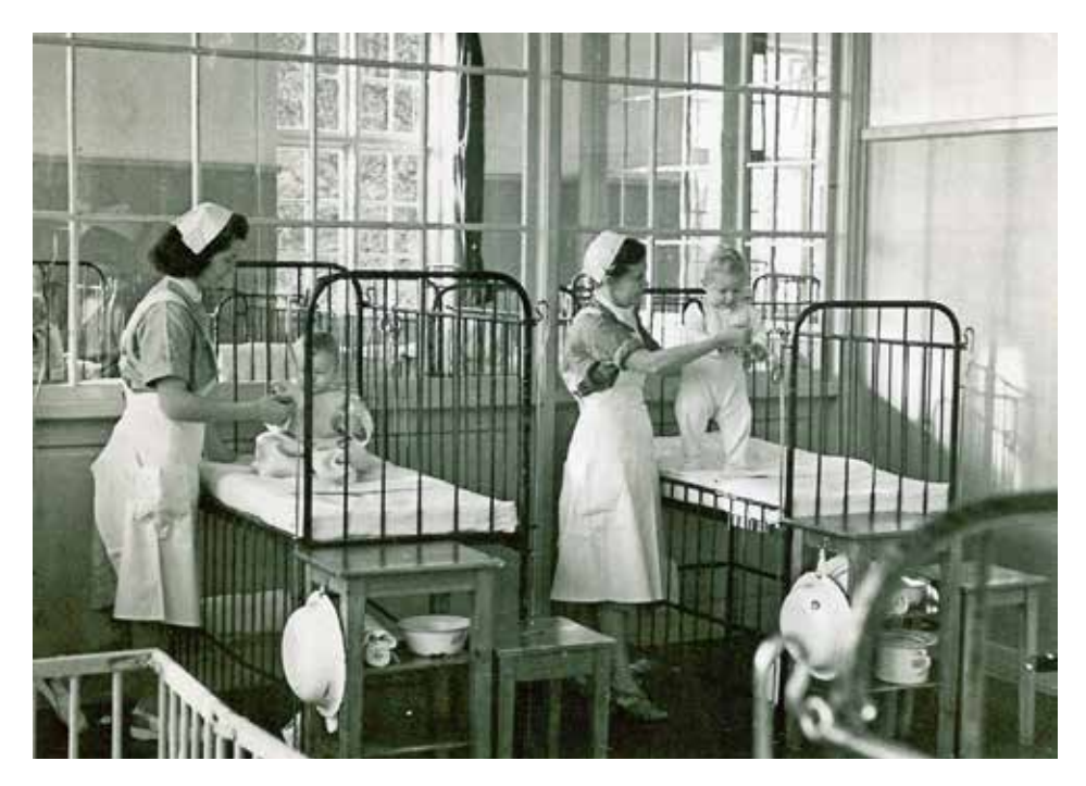
Ward F1 in the new pavilion with two nurses and small children in 1950.

At the opening, there was room for 120 children aged 4-15 years, but the sanatorium soon proved to be undersized. In 1917, a pavilion was opened for the youngest children, which today is the setting for the Danish Museum of Nursing History. In 1933 another smaller building was added, which now contains the museum archives. The total capacity of the sanatorium was now 185 beds, but still many admissions had to be rejected.