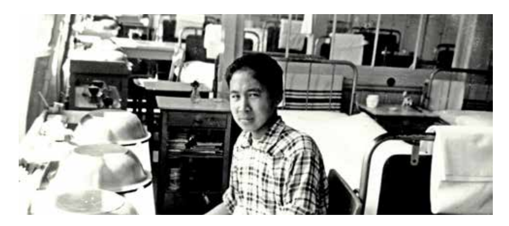
The oldest boys lived on the first floor; here a Greenlandic boy sitting in his ward in front of the wash basins.

The Greenlandic children came to Denmark as a result of the Danish effort to track down patients with tuberculosis, which was a widespread disease in Greenland. The X-ray ship "Misigssut" sailed from outpost to outpost where the children were literally dragged through the x-ray machine. If a child was diagnosed with tuberculosis, it was sent to the Christmas Seal Sanatorium in Kolding.